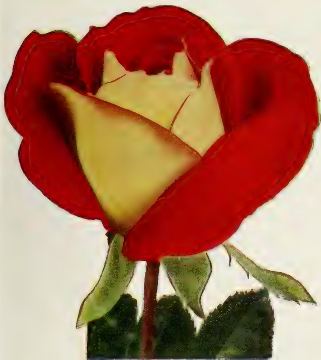
FORTY-NINER (Plant Pat. No. 792)